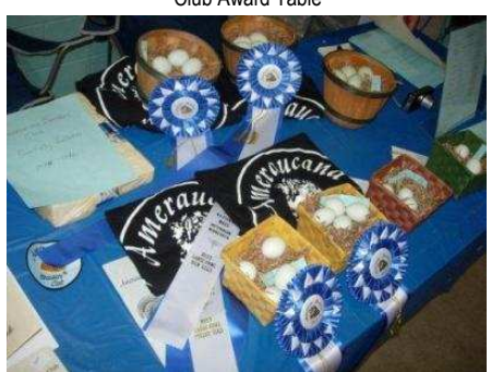
Eggs with Awards