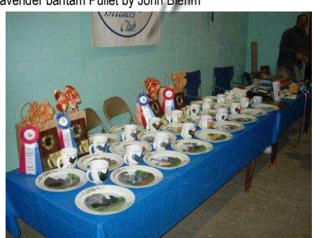
Club Award Table