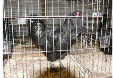
Black LF Cock by Tom Kernan