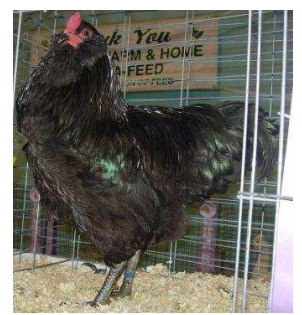
A black LF cockerel by Jeoffrey Stevens at the national meet