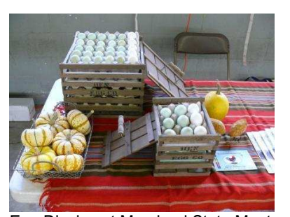
Egg Display at Maryland State Meet