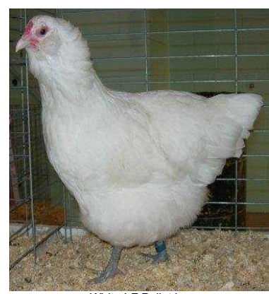
White LF Pullet by Jerry De Smidt at the national meet