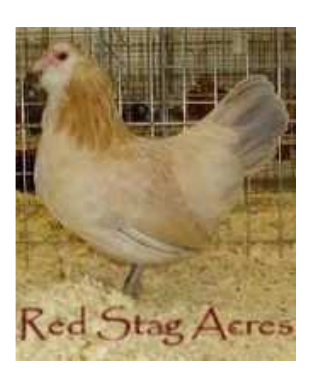
SOLD OUT FOR 2008