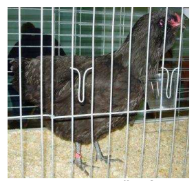
Black LF Pullet by Jeoffrey Stevens Reserve Champion Ameraucana